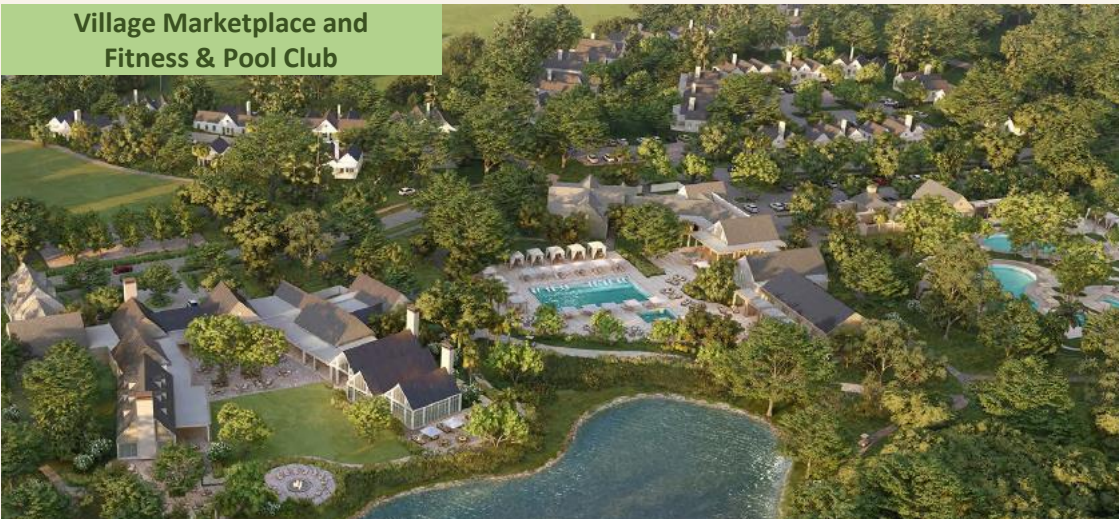
Village Marketplace and Fitness & Pool Club