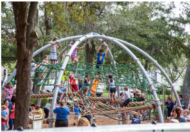
Boone Park South

Location: St. Johns Ave & Van Wert, Jacksonville, FL 32205