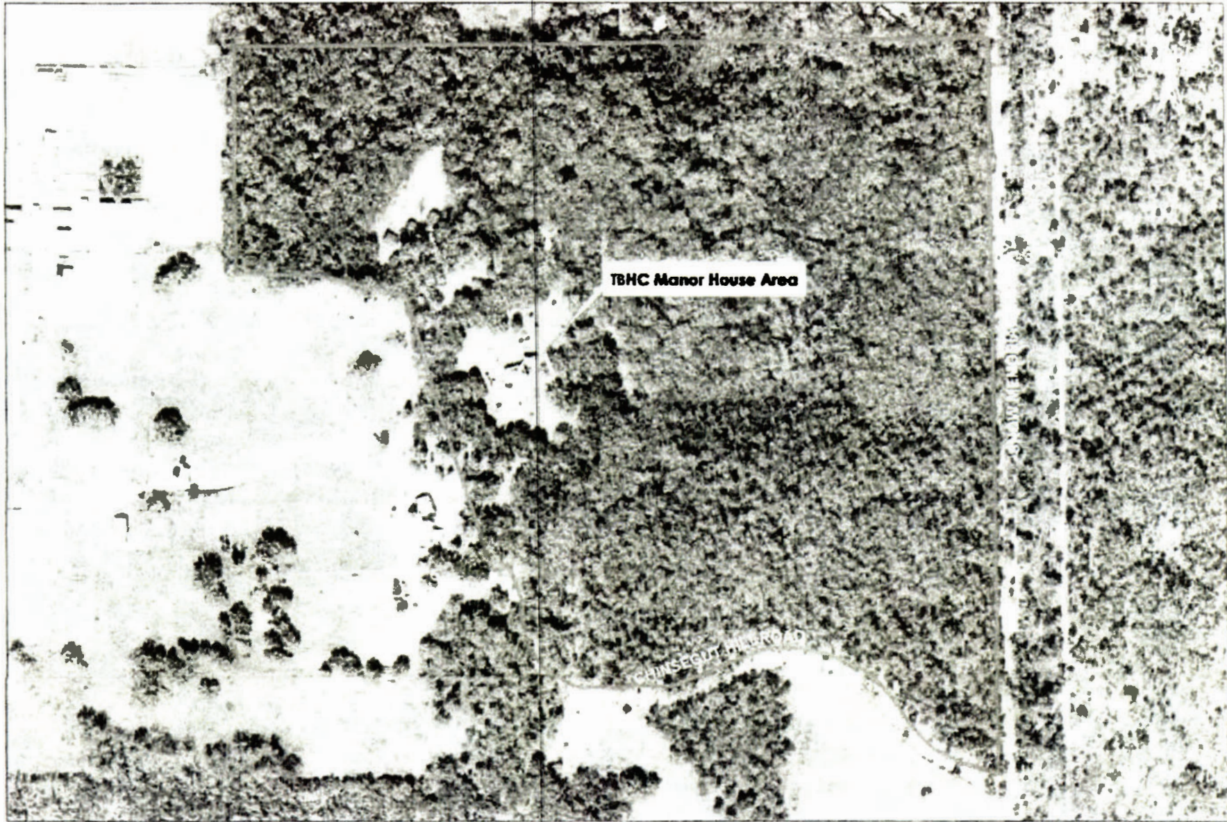
Exhibit "A" Manor House Site Plan