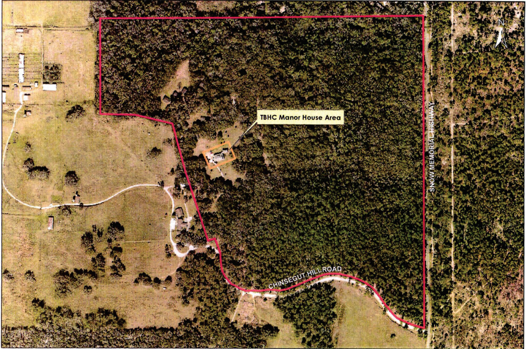
Exhibit A Manor House Site Plan