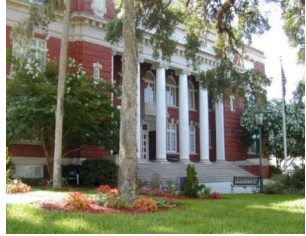
HISTORIC COURTHOUSE HERNANDO COUNTY