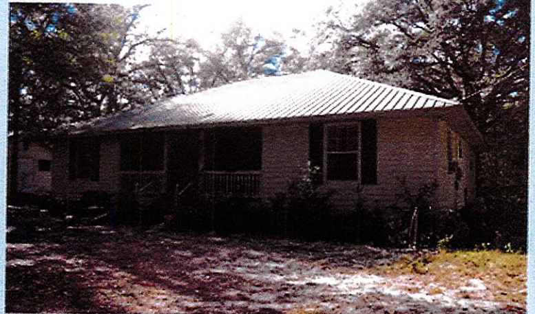
Bldg #1 - SINGLE FAMILY RESIDENCE

Building: $181,613 Assessed: $193,441 Features: $1,266 Exempt: $50,500 Land: $112,000 Capped: $193,441 AG Land: $0 Excl Cap: $0 Market: $294,879 Taxable: $142,941