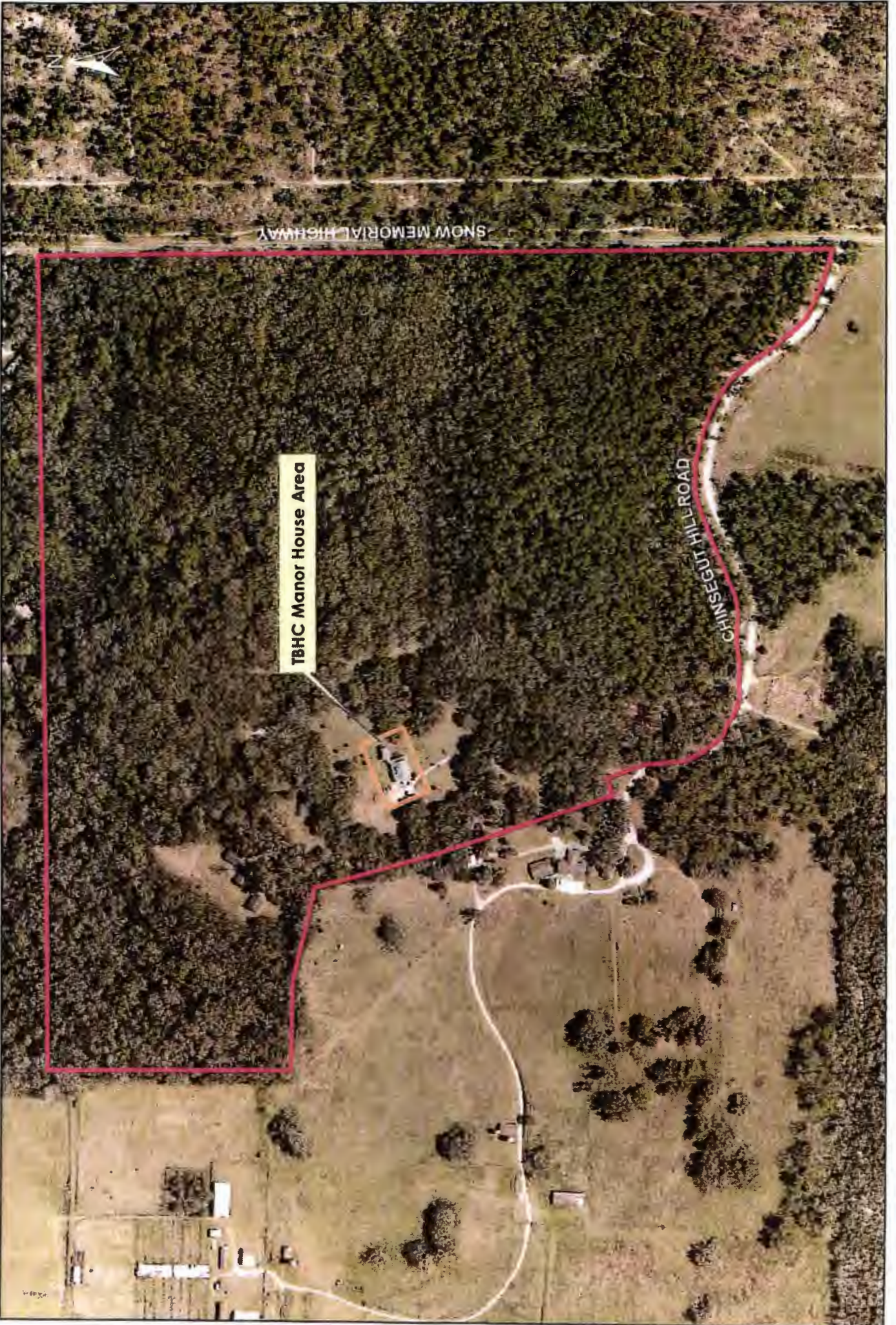
Exhibit A Manor House Site Plan