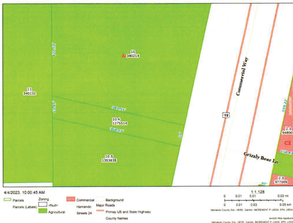
Figure 2. Rucker Property – Key No. 340214 & 1353635 Current Zoning Map