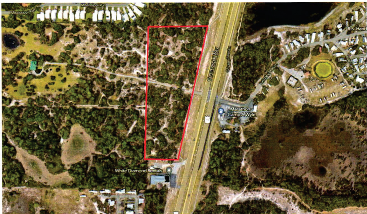
Figure 1. Rucker Property – Key No. 340214 & 1353635 Aerial Location Map

The subject property, consisting of approximately 6.9 acres, is located west of US 19/Commercial Way and south of Glen Lakes Boulevard in Section 24, Township 22 South, Range 17 East, Hernando County, Florida. The property covered by this application is identified by the Hernando County Property Appraiser (HCPA) as Key Nos. 340214 & 1353635. Refer to Figure 1 for the project Aerial Location Map.