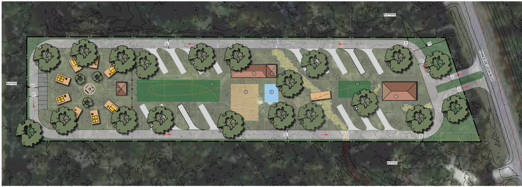
1 SKETCH PLAN Scale: 1" = 40'-0"