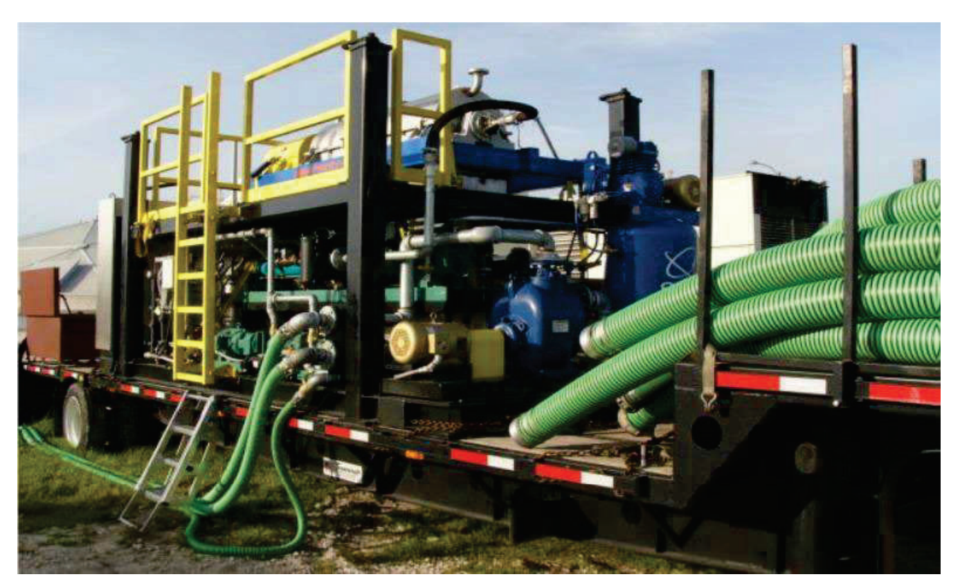
Actual equipment will vary depending on customer's needs and availability

THIS EQUIPMENT LEASE or PILOT TESTING AGREEMENT is made by and between: