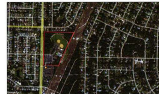
PROJECT LOCATION NTS