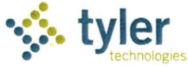
Exhibit 1 Amendment Investment Summary

The following Amendment Investment Summary details the additional software, products, and services to be delivered by us to you under the terms of the Agreement. This Amendment Investment Summary is effective as of the Effective Date, despite any expiration date in the Investment Summary that may have lapsed as of the Effective Date.