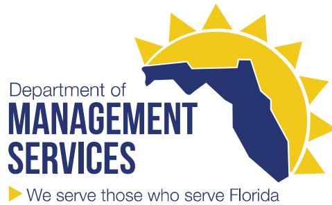
EXHIBIT A ADDITIONAL SPECIAL CONTRACT CONDITIONS

The Contractor and agencies, as defined in section 287.012, Florida Statutes acknowledge and agree to be bound by the terms and conditions of the Master Contract except as otherwise specified in the Contract, which includes the Special Contract Conditions and these Additional Special Contract Conditions.