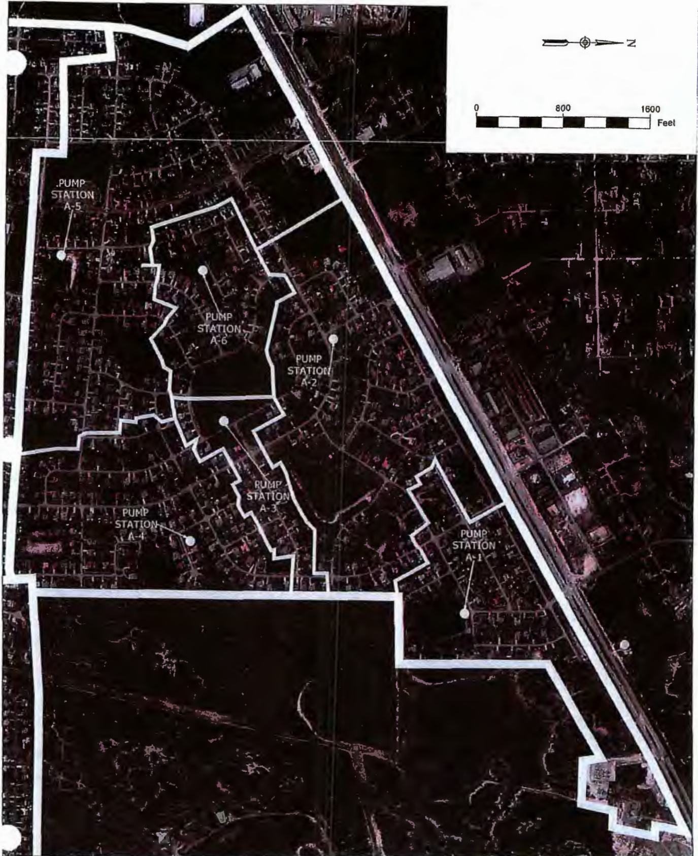
Figure 15. District A