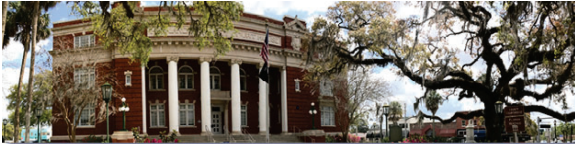
Area of Operations of Board of County Commissioners