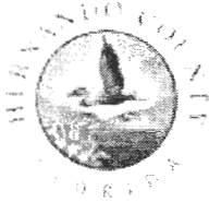
EXHIBIT Kiosk and RFP No. 24-RFP00847 AP Automated Parking Management Solution for Hernando County Parks