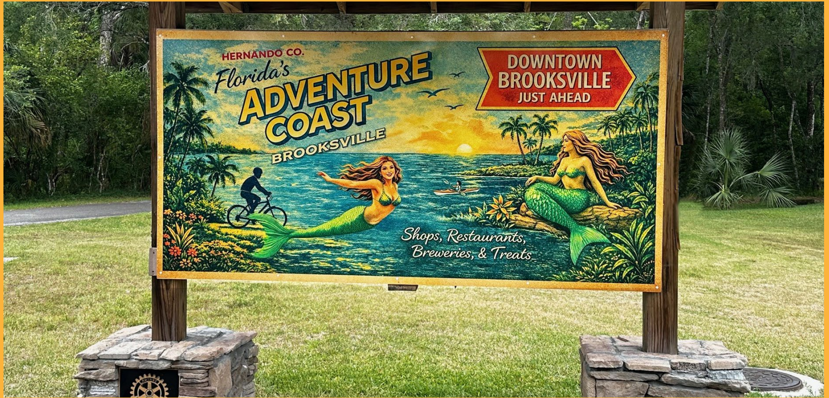
RUSSELL ST PARK/GOOD NEIGHBOR TRAIL SIGN