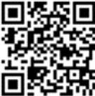
Hernando County Solid Waste District