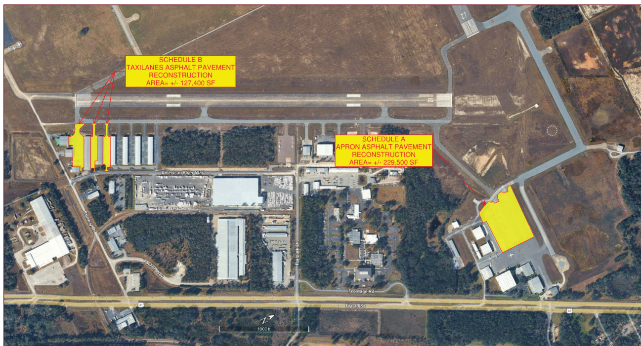
Figure No. 1: Project Layout

Hernando County Board of County Commissioners (HCBC) intends to implement a number of improvements at Brooksville-Tampa Bay Regional Airport (BKV). These improvements include the reconstruction of the asphalt pavement associated with the General Aviation (GA) ramp and Hangars 100 through 104 taxilanes. Mohsen Design Group Incorporated (MDG) will serve as the Civil Engineering Consultant to the airport providing design and bidding phase services for this project. MDG will prepare the site/civil contract documents. Figure 1 below depicts the proposed pavement improvement areas. The detailed scope of the work is provided herein.