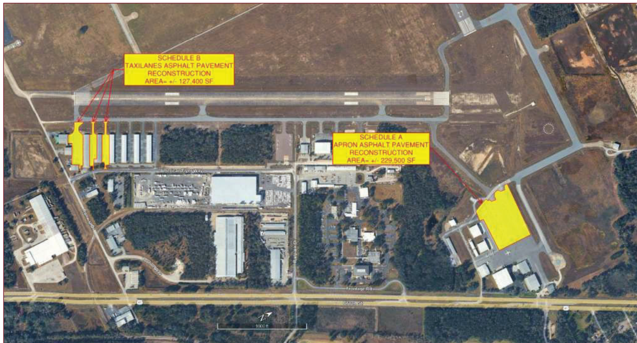
Figure No. 1: Project Layout

Hernando County Board of County Commissioners (HCBC) intends to implement a number of improvements at Brooksville-Tampa Bay Regional Airport (BKV). These improvements include the reconstruction of the asphalt pavement associated with the General Aviation (GA) ramp and Hangars 100 through 104 taxilanes. Mohsen Design Group Incorporated (MDG) will serve as the Civil Engineering Consultant to the airport providing design services for this project. MDG will prepare the site/civil contract documents. Figure 1 below depicts the proposed pavement improvement areas. The detailed scope of the work is provided herein.